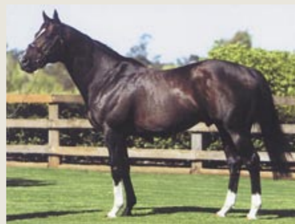
Tale of the Cat by Storm Cat