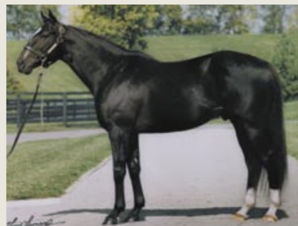
Storm Creek by Storm Cat