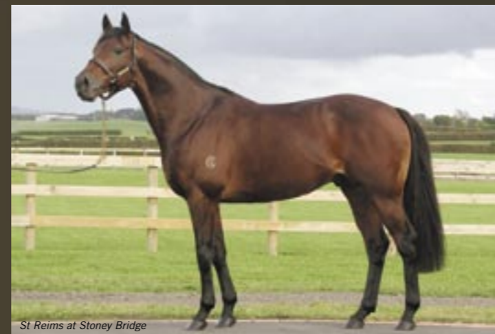
St Reims at Stoney Bridge

16 wins - 4 at 2 – in 33 starts. Joint 2nd top USA 3YO Filly. USA Broodmare of the Year 1968. Dam of 9 winners (5 SW) incl. Gr1 wnr Dike (Wood Memorial).