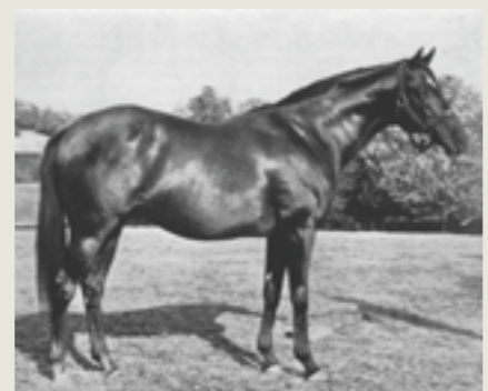
3rd damsire – NASRULLAH Champion English 2YO Colt 5 wins in 10 starts