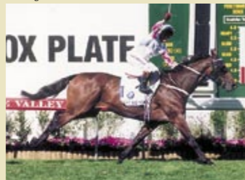
Might and Power